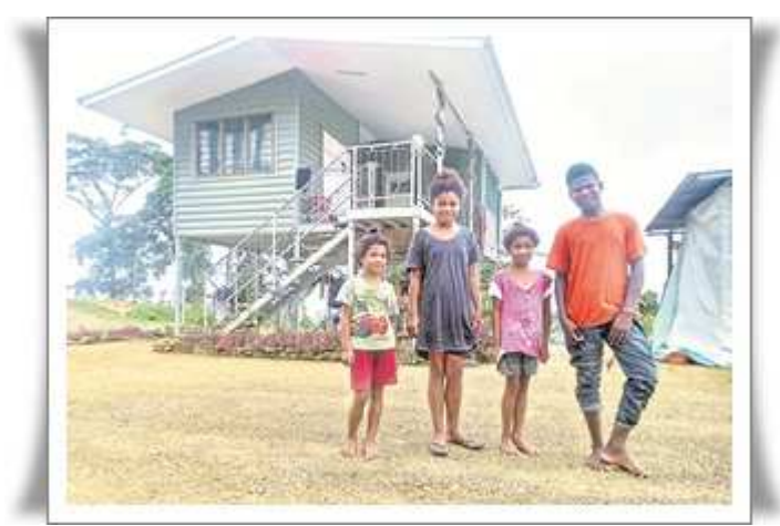
Some children in front of a new three-bedroom house for locals affected by the Woodlark gold project.

By SHIRLEY MAULUDU, January 16, 2023, The National Business