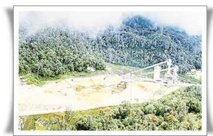
Lime plant at Porgera gold mine. The Porgera gold mine was placed under care and maintenance since April 2020.

By PETER ESILA, January 25, 2023, The National Business