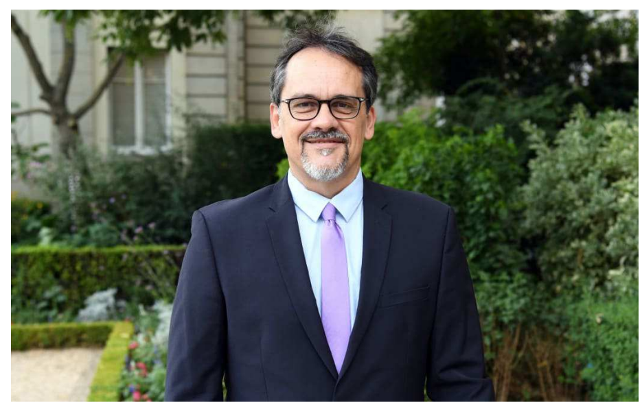
New Caledonia's Budget Minister Philippe Dunoyer

French Overseas Minister Jean-Francois Carenco told the French National Assembly that he is in contact with local authorities and other parties involved to come up with a short-term solution. "To work on it, the government is currently in contact with local authorities to scrutinise not only the situation of SLN but the whole nickel industry in New Caledonia." Carenco said energy, exportation, and production are areas that should be worked on. He also said there is the possibility of a recovery plan, however, the situation remains fragile and choices need to be made. The president of New Caledonia's Southern Province Sonia Backes said in November she expects the French government to come to the rescue of SLN. She said if the government doesn't write out a cheque, SLN will close this month, which she said is not acceptable for anyone. SLN is New Caledonia's largest company, employing about 2000 people directly and a further 8,000 indirectly. Backes <u>said last year</u> that bankruptcy of SLN would not only mean the loss of thousands of jobs but also sink New Caledonia's social welfare system.