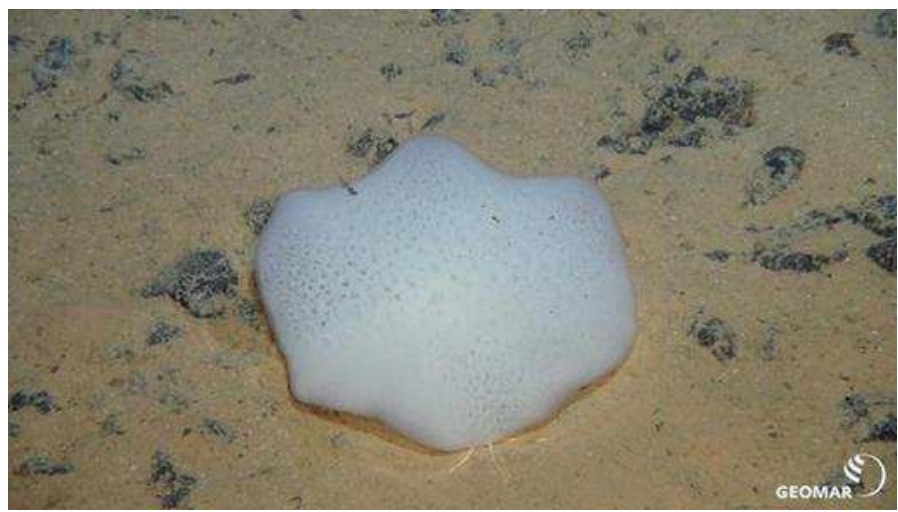
Schwamm auf einer Manganknolle.