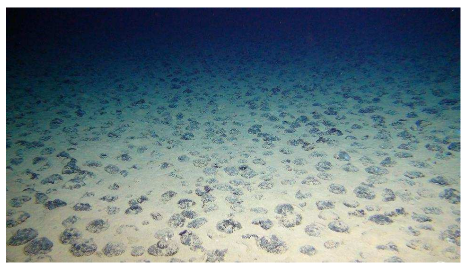
Meeresboden mit vielen Manganknollen. Sie enthalten neben Mangan auch Eisen, Kupfer, Nickel und Kobalt und somit wichtige Rohstoffe.

Dicht an dicht liegen in manchen Meeresgebieten die Objekte der Begierde am Meeresboden: Manganknollen, die neben dem namensgebenden Mangan und Eisen auch viel Kupfer, Nickel und Kobalt enthalten. Es handelt sich um Metalle, die an Land nicht sehr häufig zu finden, allerdings von hohem wirtschaftlichem Interesse sind. Zum Beispiel werden sie für Batterien in Elektroautos und in Solar- und Windkraftanlagen genutzt. Sie spielen eine entscheidende Rolle bei der Energiewende.